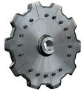
Sprocket with interchangeable tooth segments and enlarged gap between teeth