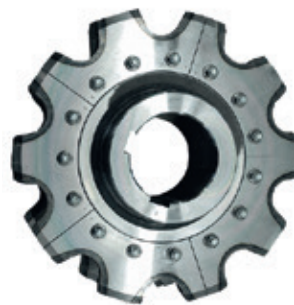
Drive sprocket with interchangeable tooth segments

In addition to the standard sprockets, HEKO also manufactures special drive and deflection wheels for steel cell conveyors, which in terms of dimensions and geometries can be adjusted to the respective conveying task. In addition to the sprockets, and in its own production facilities, HEKO also manufactures complete drive and deflection units consisting of sprockets, shafts / axes and bearings according to your requirements and specifications. Gladly advise we help you to optimize your funding task