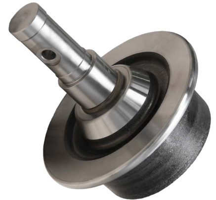
Roller with stub shaft