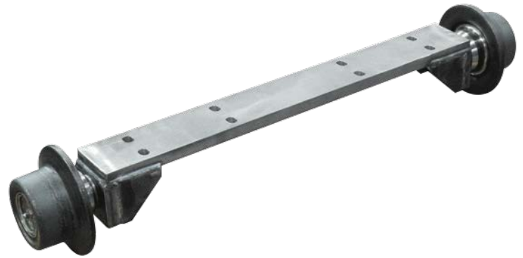
Bracket with rollers

Keep tape cell away. For this reason, HEKO manufactures the strap hangers from high-strength quality steel. Also due to this reason, HEKO manufactures the brackets only from high-quality steel.