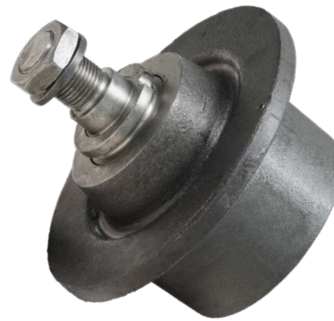
Roller with thread shaft

As standard HEKO uses an axis which is made of high-strength tempered steel with deep groove ball bearings arranged in pairs. The combination of a special lamellar seal and an LSTO ring make sure that no fine conveying material gets into the system. Together with the lifetime lubrication a good operating time is ensured.